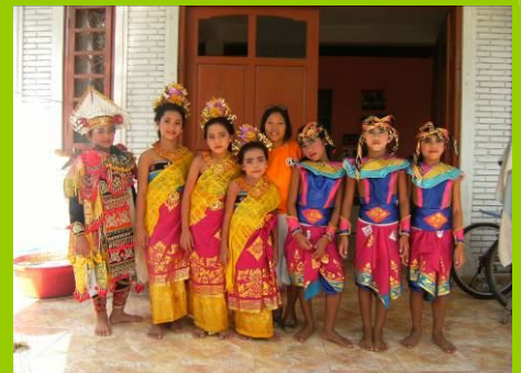
Some of the group

Performances were given at the Garuda Wisnu Kencana Cultural Center, the Asia Intl. AIDS Conference, several restaurants, and the Indonesia National Sai Conference.