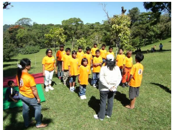
End of last year school awards

We appreciate greatly ANY contributions. We are happy to discuss sponsoring a child by email care4child@ykpa.org or via Skype online.