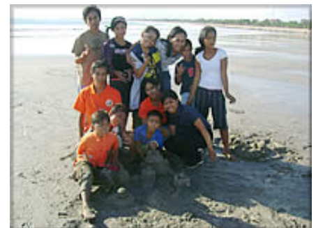
Fun day at the beach