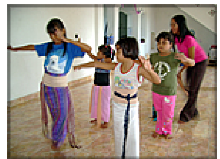
Balinese dancing class