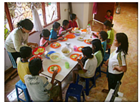
Meals at our home

Yayasan Kasih Peduli Anak (deeply loving and caring for children) is a non-denominational Indonesia non-profit charity assisting Bali street children in a transparent way with the help of local and international volunteers.